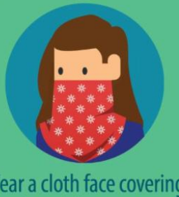
Wear a cloth face covering in public spaces